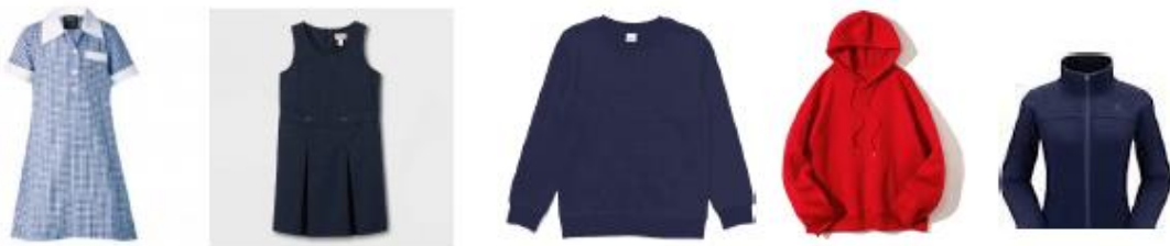
Blue checked dresses and navy pinafores