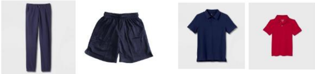
Trackpants and slacks Basketball, cotton and twill shorts Navy and red t-shirts and polos