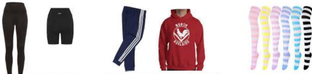
Black leggings or black bike shorts. Shorts too tight, short or restrictive to participate comfortably